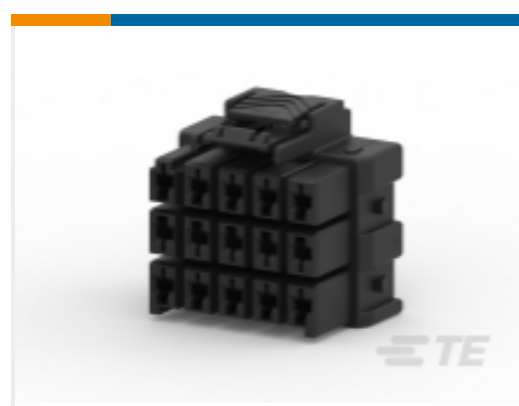
TE Part # 1-2232357-5 PTL 3X5 PLUG HSG HOT WIRE KEY A BLK