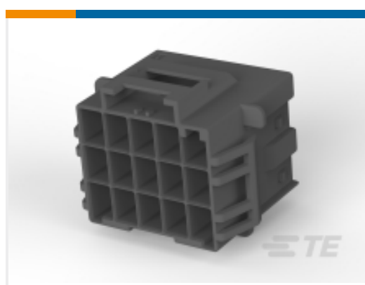
TE Part # 5-2232356-7 PTL 3X5 CAP PANEL MT GLW WIRE KEY A DGR