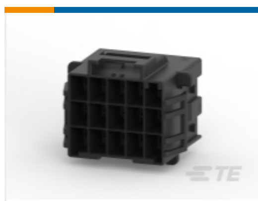
TE Part # 1-2232356-5 PTL 3X5 CAP PANEL MT HOT WIRE KEY A BLK